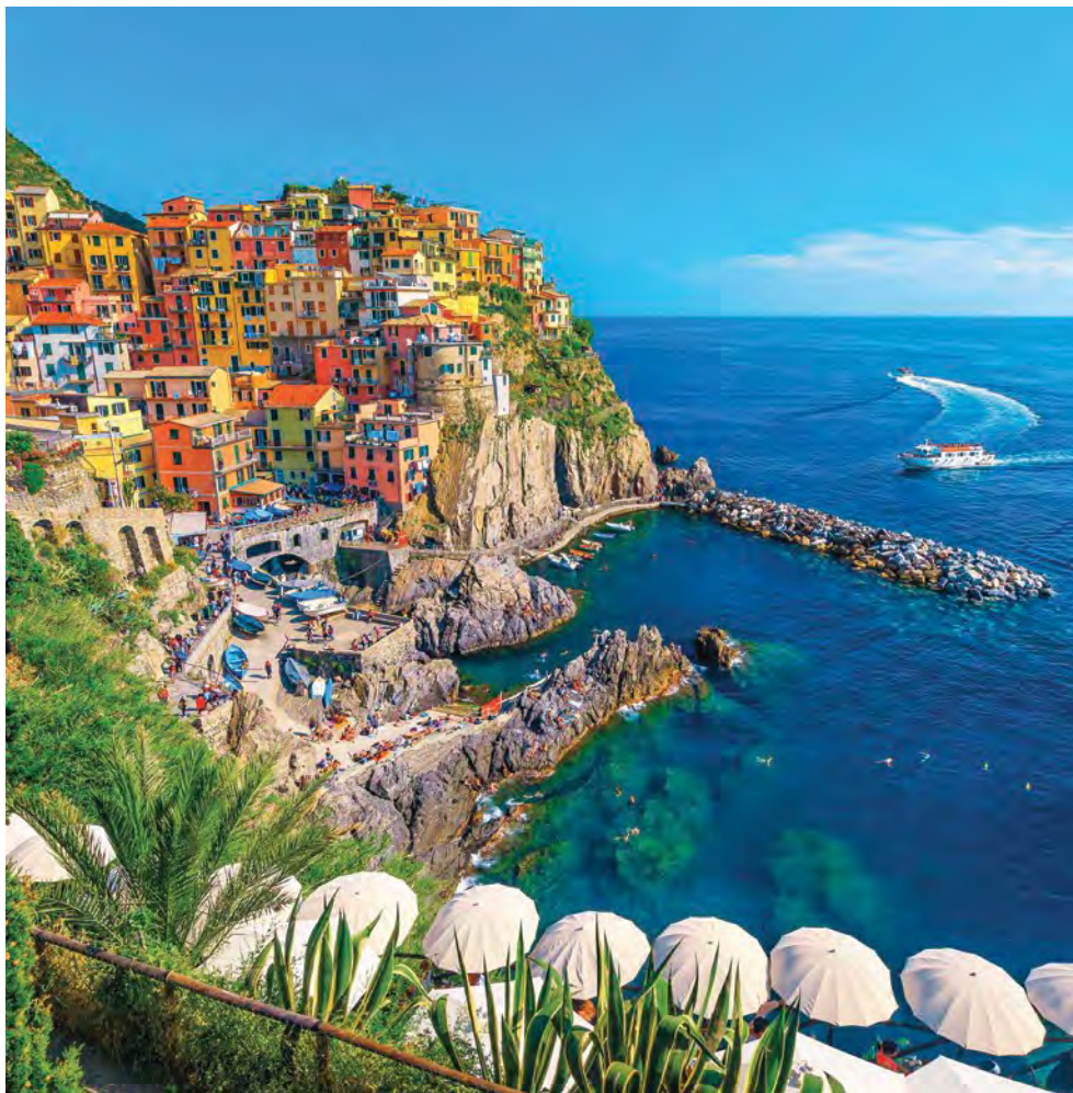
Manarola, Cinque Terre