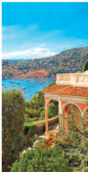
View of the Côte d'Azur from Villa Ephrussi

Knowledgeable Lecturers deepen your appreciation for the region and its history, culture and current events.