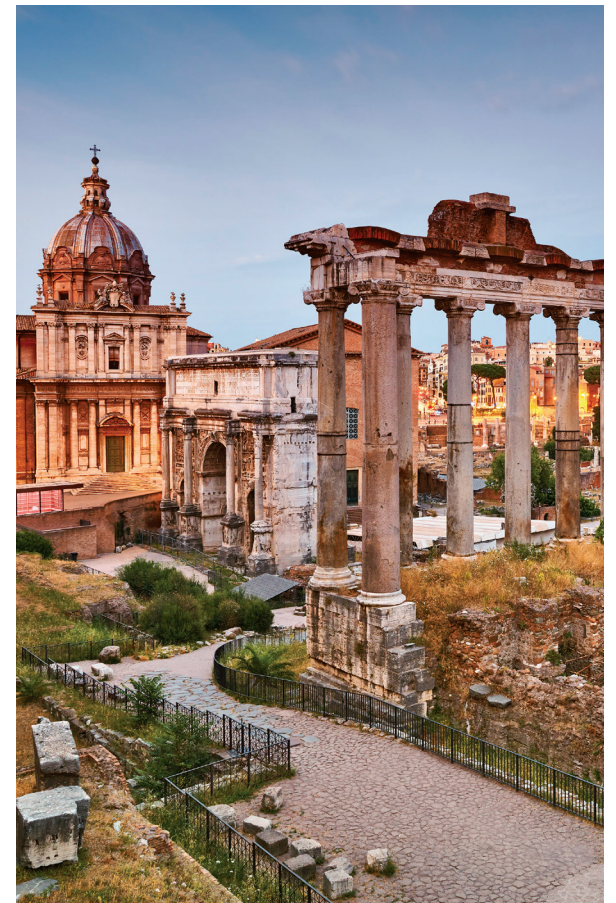
The Roman Forum dates to the 7 th century BCE.

Day 16: Depart for U.S. We depart early this morning for our connecting flights to the U.S. B