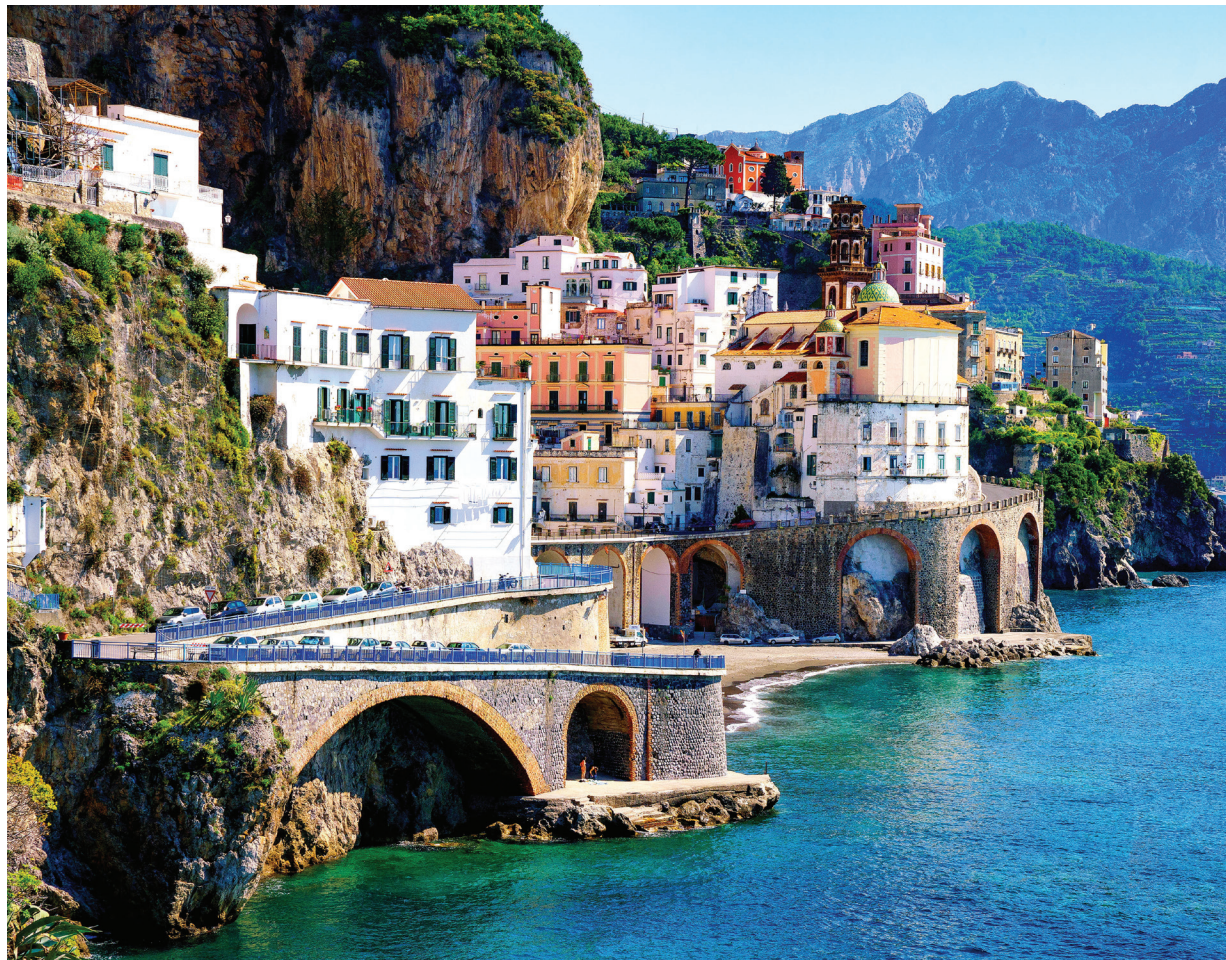
Listed as a UNESCO site, the Amalfi Coast boasts colorful villages and stunning scenery overlooking the Tyrrhenian Sea.