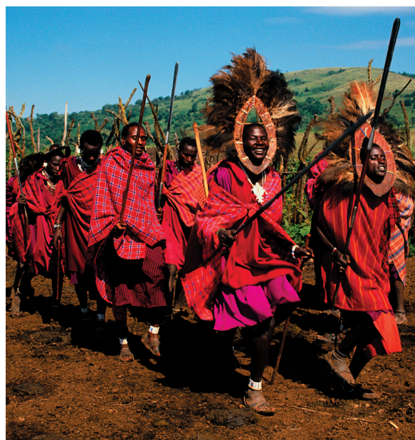
Kenya’s native Maasai people

Day 16: Arrive U.S. We reach the U.S. today and connect with our flights home.