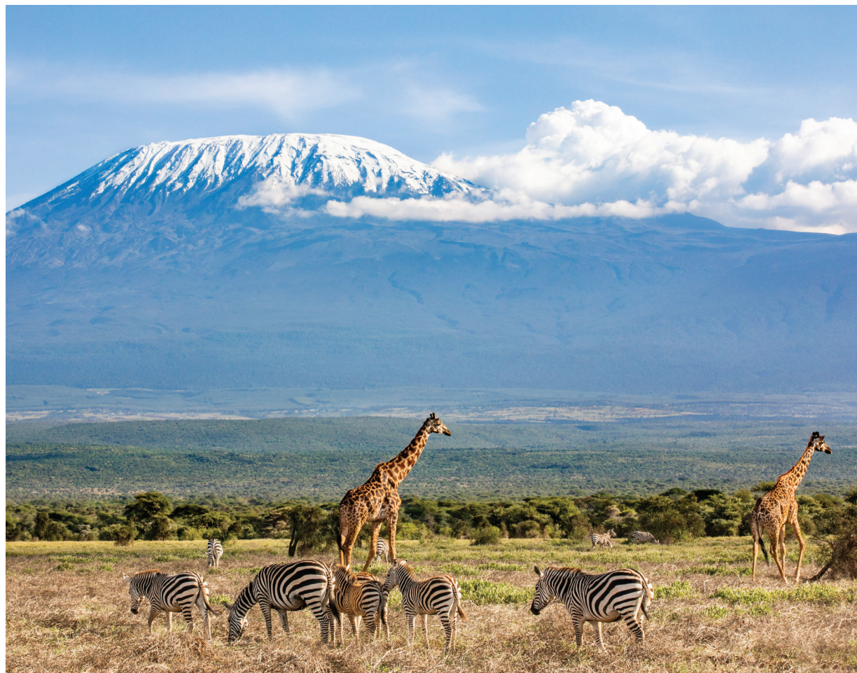
The peaceable kingdom. Giraffe and zebra graze in the shadow of Mt. Kilimanjaro.