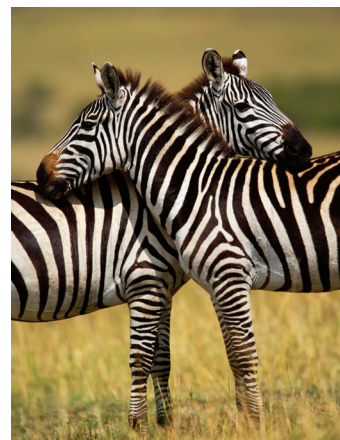
We’re sure to see zebra.

Day 11: Serengeti/Masai Mara We leave Tanzania today, crossing into Kenya and continuing on to Masai Mara by air. Kenya’s premier game reserve rich with animal life, the Mara is the traditional homeland of the native Maasai people. Known especially for the