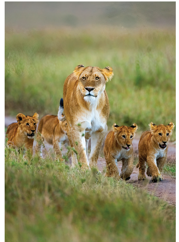
Walking down the road ...