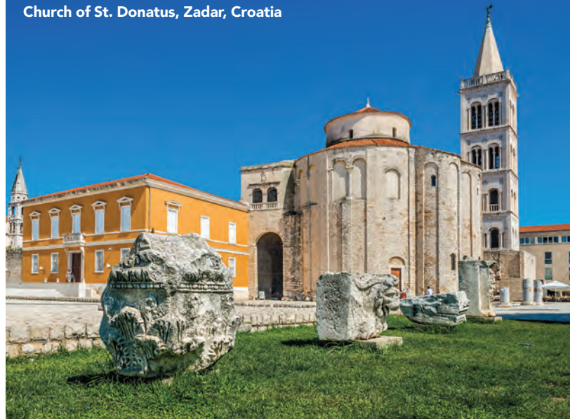
Church of St. Donatus, Zadar, Croatia

Sail to the lavender fields of Hvar, which Condé Nast Traveler readers twice voted "the world's most beautiful island." Here, discover Stari Grad, Croatia's oldest town. Once a Greek colony, Stari Grad has been UNESCO-listed for maintaining its ancient Greek system of farming. After free time, take in the views from 16th-century Venetian fortress Španjola, perched 300 feet above Hvar. Then enjoy an expert-guided tour of Hvar's Gothic palaces and cloisters, Baroque cathedrals, and grand squares surrounded by 13th-century walls. Instead of Hvar and Stari Grad, you may opt to take a speed boat to Split for a tour of the UNESCO-listed, fourth-century palace of Roman emperor Diocletian, into which Split's historical center is uniquely integrated. Explore the seventh-century Cathedral of Saint Domnius, the oldest Catholic cathedral housed in its original structure, as well as 12th- and 13th-century Romanesque churches, 15th-century Gothic palaces and other treasures, all within the palace's environs. Transfer to Hvar after lunch and return to Sea Cloud II . B,L,D