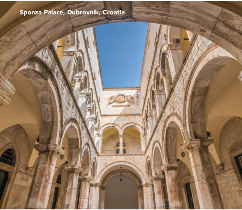
Sponza Palace, Dubrovnik, Croatia