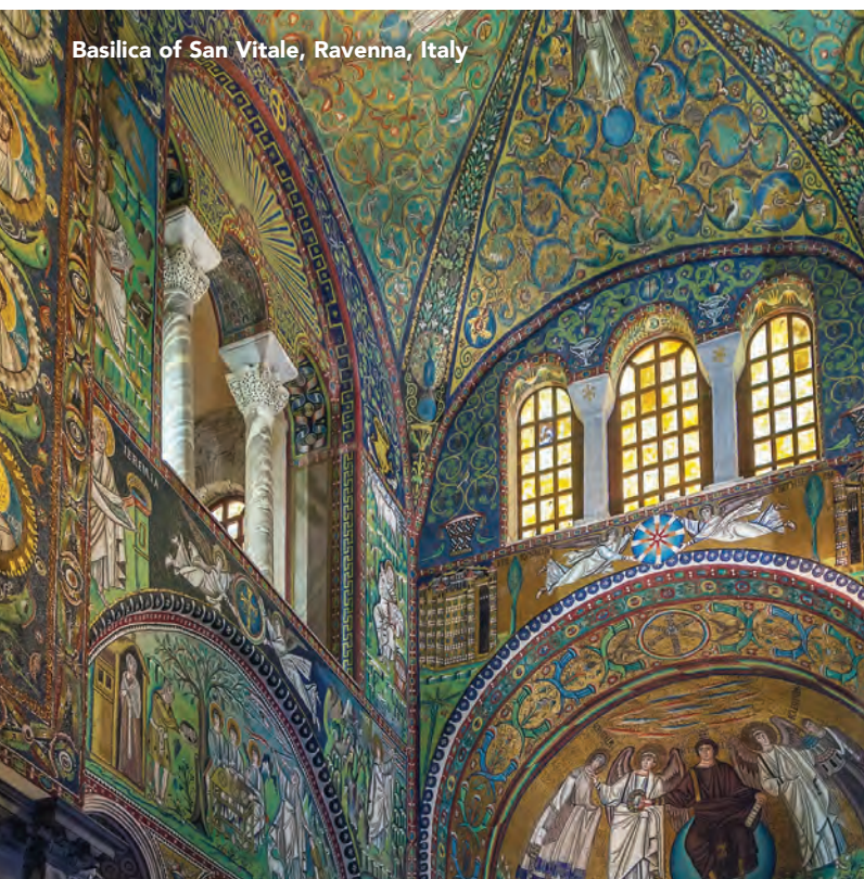
Basilica of San Vitale, Ravenna, Italy

Arrive at Venice's Marco Polo International Airport, where you will be transferred to the vibrant Dorsoduro neighborhood, known for its ornate churches, picturesque squares, and canals. After lunch, embark Sea Cloud II and remain on deck as the ship sails out of the Grand Canal. L,D