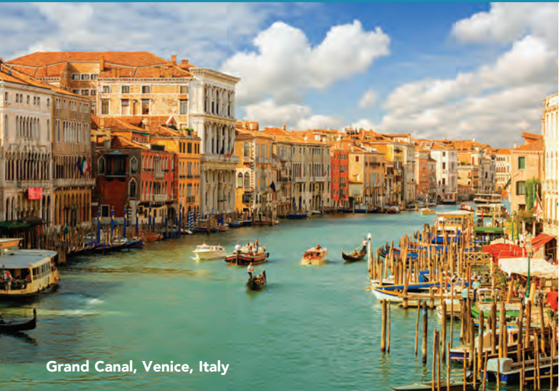
Grand Canal, Venice, Italy