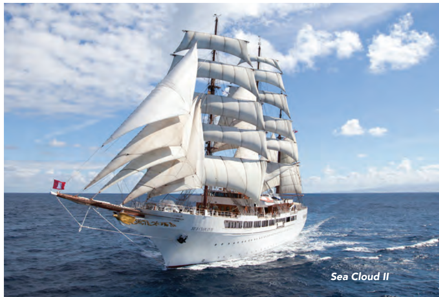
Sea Cloud II