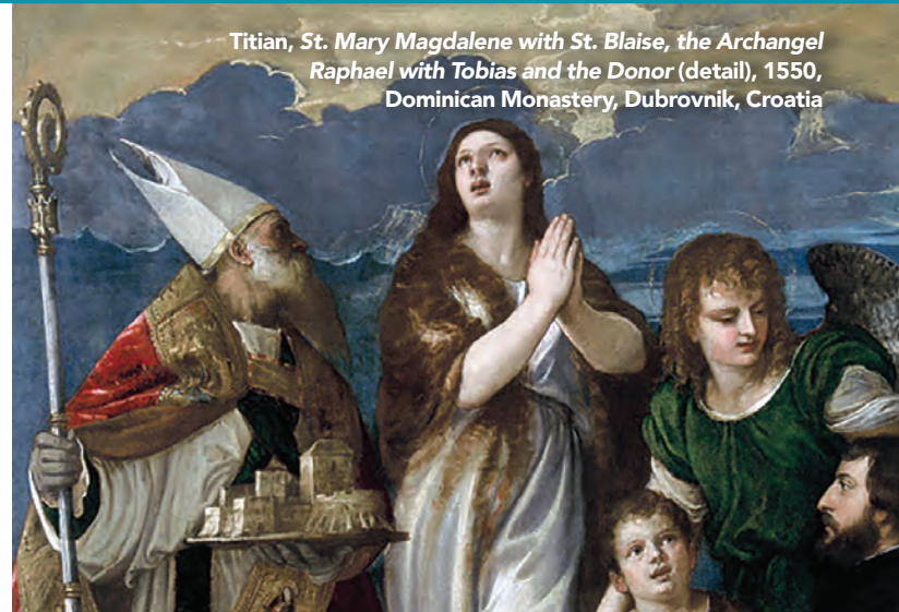
Titian, St. Mary Magdalene with St. Blaise, the Archangel Raphael with Tobias and the Donor (detail), 1550, Dominican Monastery, Dubrovnik, Croatia