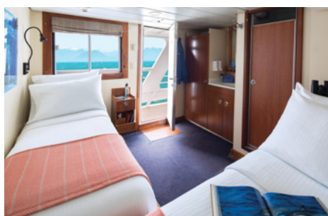
Category 2 cabin with single beds.

All cabins face outside with windows, private facilities, and climate controls. Cabins are equipped with Wi-Fi and multiple electrical and USB outlets. Botanically inspired shampoo, conditioner, shower gel, and lotion are all