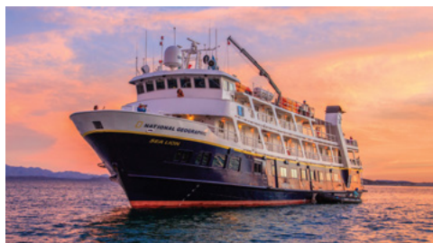
National Geographic Sea Lion.

An expedition ship is an ideal way to explore the Pacific Northwest. Traveling expedition-style allows you to experience the region with all your senses—seeing its grand beauty, hearing its waterfalls and wild silences, feeling its fresh air, and tasting it daily in the delectable, locally sourced food served aboard. You travel in comfort aboard the purpose built National Geographic Sea Lion , which features open decks, spacious cabins, generous windows, and an accommodating bow area. The 31-cabin ship is key to your experience. An onboard fleet of Zodiacs and kayaks are the perfect vehicles to have up-close views of the dramatic scenery of the Palouse River. Life aboard ship is warm and welcoming. The lounge graciously accommodates the expedition community during nightly Recap and wine tastings, and the casual dining room serves meals in single seatings with unassigned tables for easy mingling.