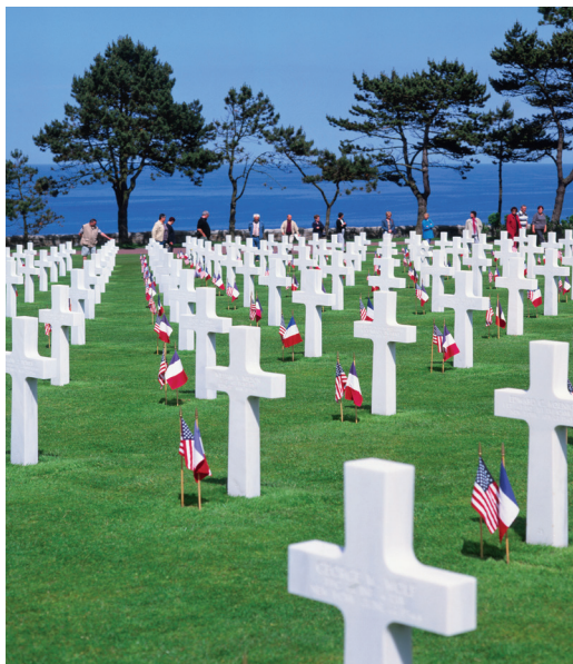
On Day 12, we visit the American Cemetery at Omaha Beach.

free for independent exploration; tonight we gather for a farewell dinner to bid “ adieu ” to France. B,D