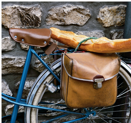
Typical French scene

Day 14: Paris Today we get acquainted with one of the world's greatest cities, seeing the highlights on this morning's city tour, including a guided visit to the Musée Rodin, a museum dedicated to prolific French sculptor Auguste Rodin. This afternoon is