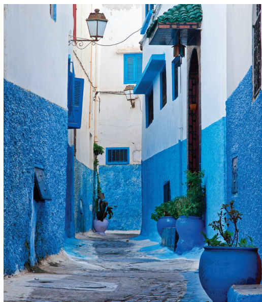
Rabat's Kasbah des Oudaias

Day 14: Depart for U.S. After breakfast this morning we transfer to the airport for our return flight to the U.S. B