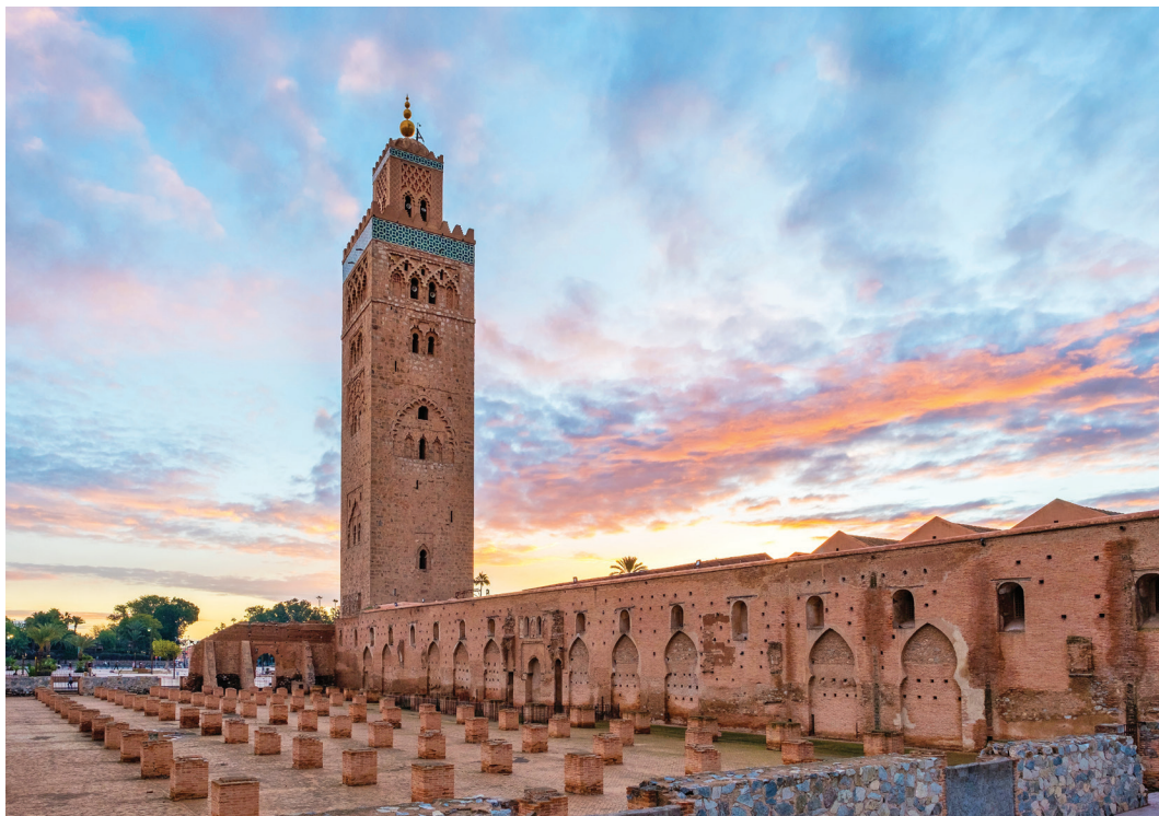
We see the distinctive Koutoubia Mosque – Marrakech’s largest – on Day 11.

royal gates. Then we walk through the Fez medina , where we see some hidden treasures, including the Blue Gate, the most picturesque of the Old City’s historic gates; the medieval school of Bouanania; and the 12 th -century home of Jewish scholar Maimonides; and the authentic food market. The remainder of the afternoon is free for independent exploration and lunch on our own. B,L,D