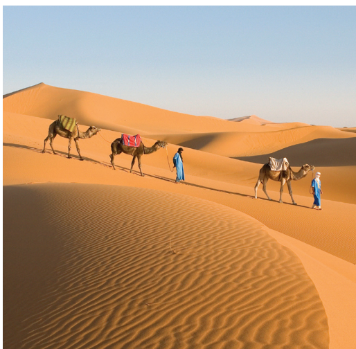
We ride camels in the Sahara.

Day 13: Marrakech/Casablanca We leave Marrakech this morning by coach for storied Casablanca, Morocco's