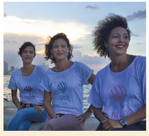
Founders and owners of Dador

Then, visit the historic Hotel Nacional for a tour of the property followed by dinner at a paladar .