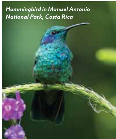
Hummingbird in Manuel Antonio National Park, Costa Rica