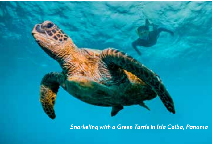
Snorkeling with a Green Turtle in Isla Coiba, Panama

This island is part of Coiba National Park, a UNESCO World Heritage site. An astounding range of wildlife calls this area home, including agoutis, howler monkeys, giant toads and green iguanas. The clear turquoise waters support bottlenose dolphins, giant seahorses and numerous species of shark and whale.