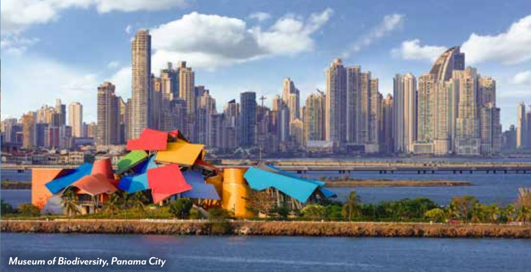
Museum of Biodiversity, Panama City