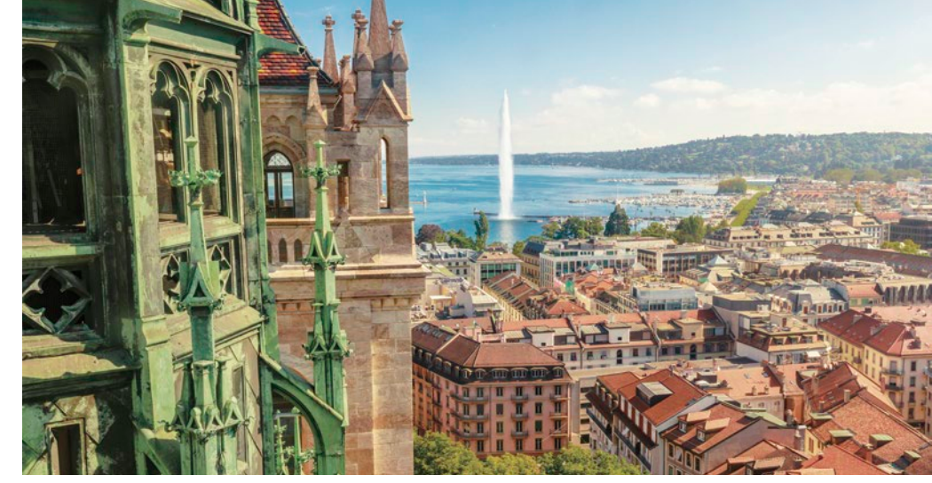
Jet d'Eau, Geneva

EAHI Connects | Swiss Cheese. Visit a countryside dairy farm. Watch a demonstration on making handmade Gruyère cheese and sample this decadent product.