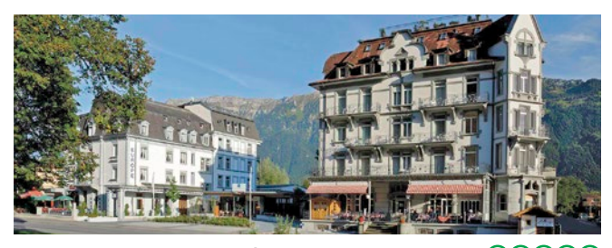
Hotel Carlton-Europe | Interlaken