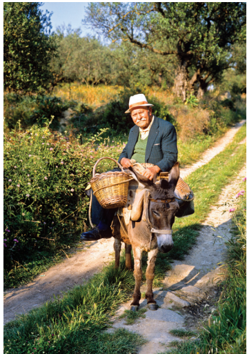
Old ways endure ...

Day 7: Nafplion/Hydra This morning we travel to the port of Metohi, where we board a private boat for the ride to Hydra, the car-free Saronic island where donkeys provide the transportation. After lunch together at a local taverna, we have free time to enjoy this picturesque island as we wish. Late afternoon we return to Nafplion for an evening at leisure. B,L