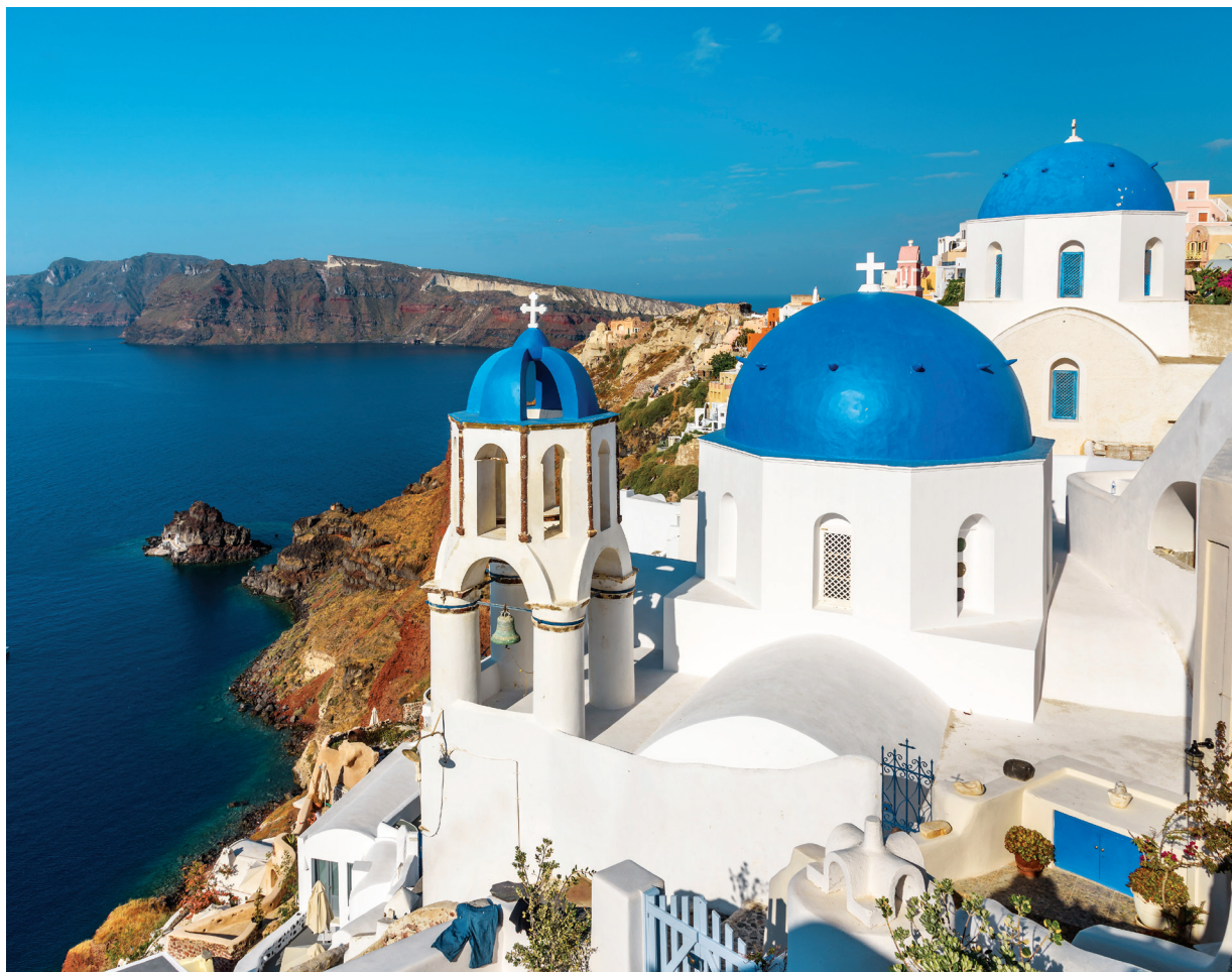
With its whitewashed houses and cobalt domes high above the Aegean, Santorini draws visitors from far and wide.

Ratings are based on the Hotel & Travel Index, the travel industry standard reference.