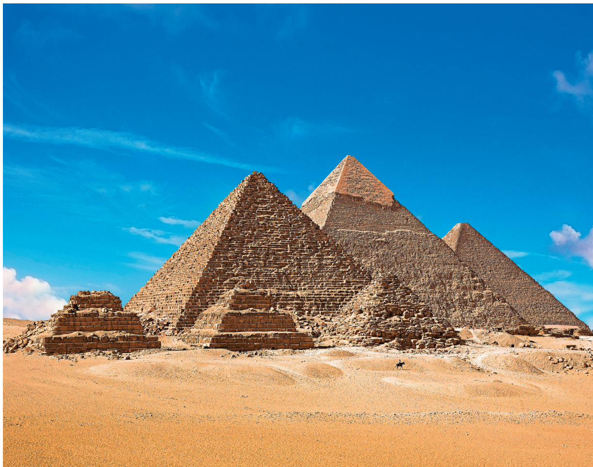
On Day 4 we travel to the Giza plateau to see the legendary pyramids, built 5,000 years ago as royal tombs.

Ratings are based on the Hotel & Travel Index, the travel industry standard reference.