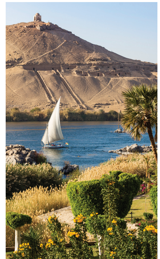
We sail traditional feluccas along the Nile.