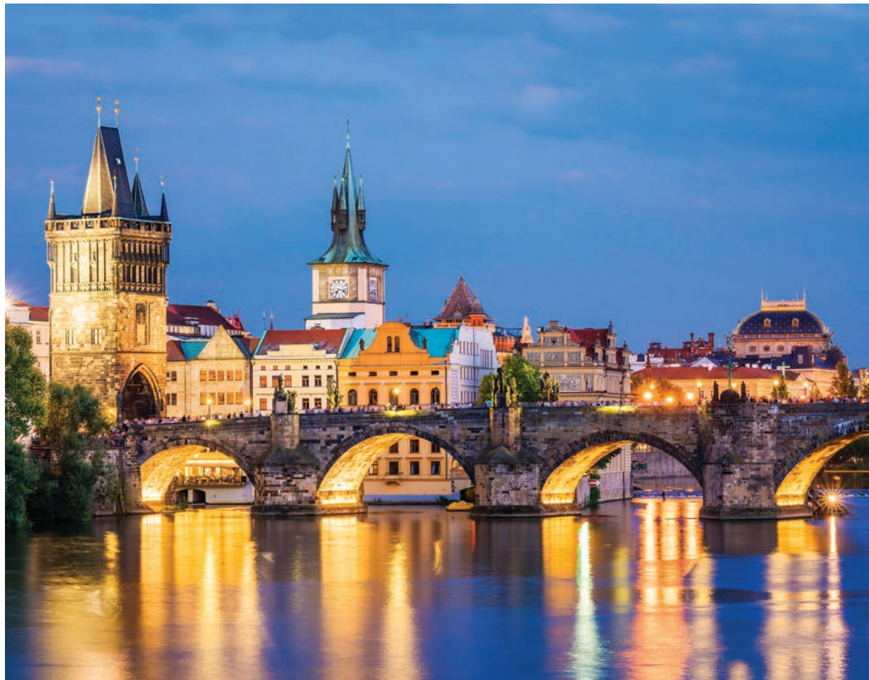
Nighttime view of Prague's Charles Bridge, which connects Old Town with Prague Castle