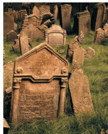
Prague's ancient Jewish Cemetery

Day 9: Budapest This morning, we take an inside visit of the Dohány Synagogue with its rich but tragic history. Built in 1859, it is the largest synagogue in Europe and the world's second largest. Then we're free to discover the "Paris of the East"