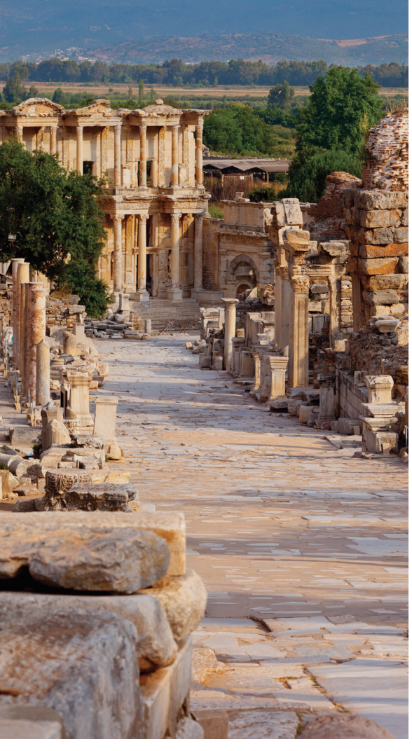
We tour the ruins at Ephesus on Day 8.